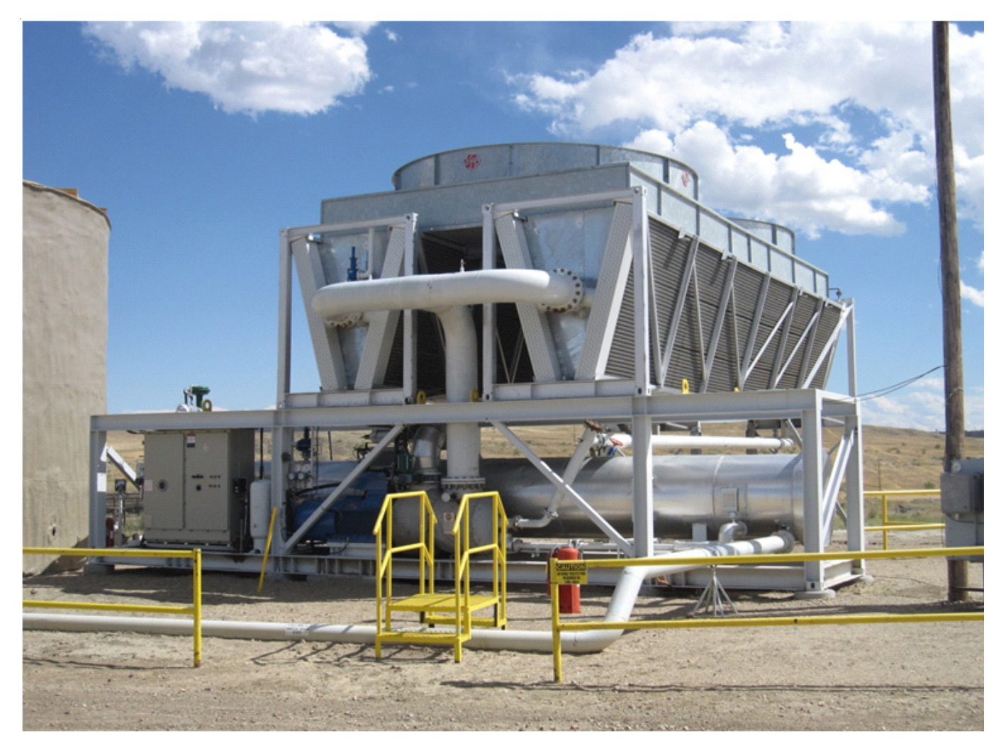
A binary generator at the Rocky Mountain Oilfield Testing facility near Casper, Wyoming. This power station uses 195 degree F water from an oil well to generate 250 kW of electricity.

Montana also is examining these promising new geothermal opportunities. In late 2011 the Flathead Electric Cooperative began drilling an exploration well near the town of Hot Springs, Montana in search of sufficiently hot water to use in a binary generator. And in 2012 a federally-funded feasibility study on using geothermal water from oil and gas wells is being conducted on the Fort Peck Assiniboine and Sioux Tribes Reservation in northeast Montana.